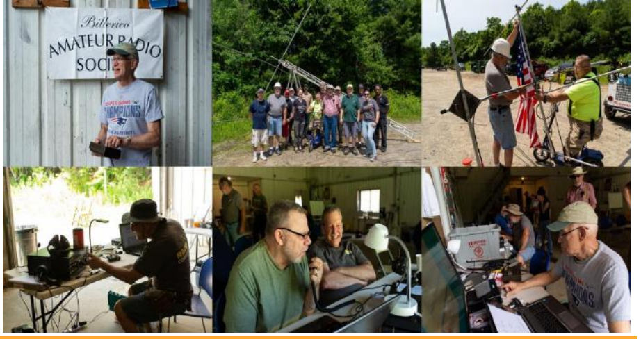
NEWS FOR AND BY BARS MEMBERS