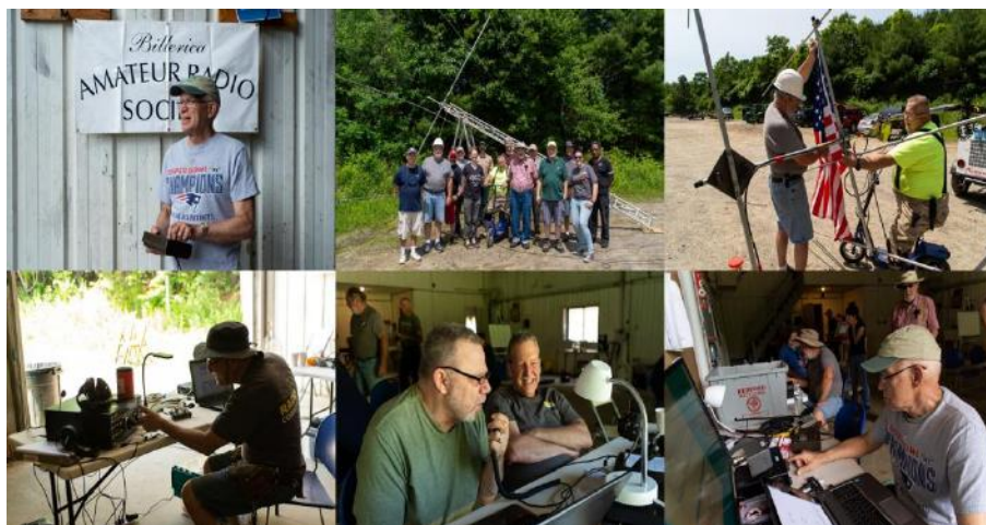
NEWS FOR AND BY BARS MEMBERS