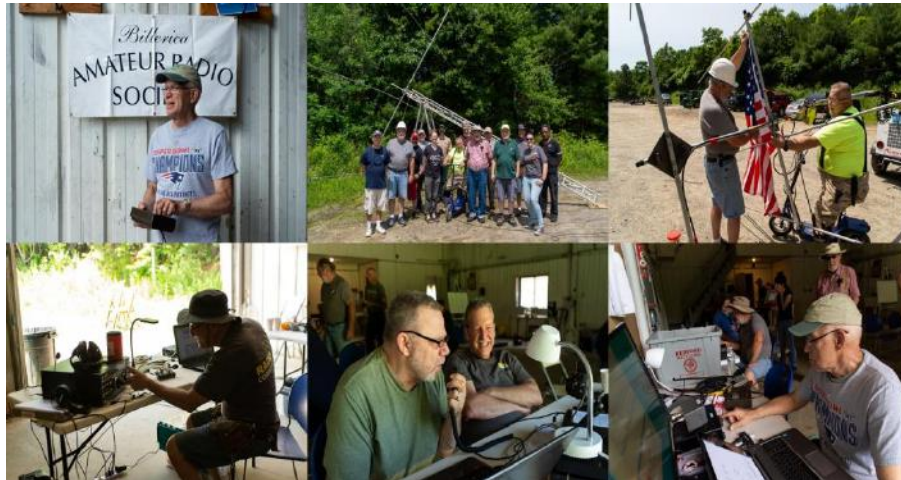
NEWS FOR AND BY BARS MEMBERS