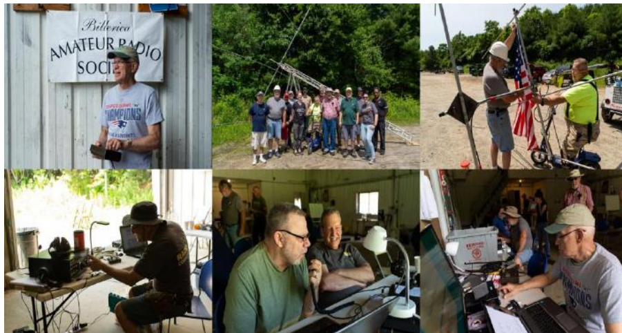
NEWS FOR AND BY BARS MEMBERS