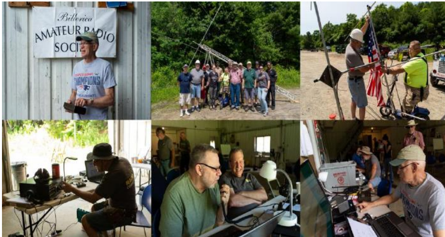
NEWS FOR AND BY BARS MEMBERS