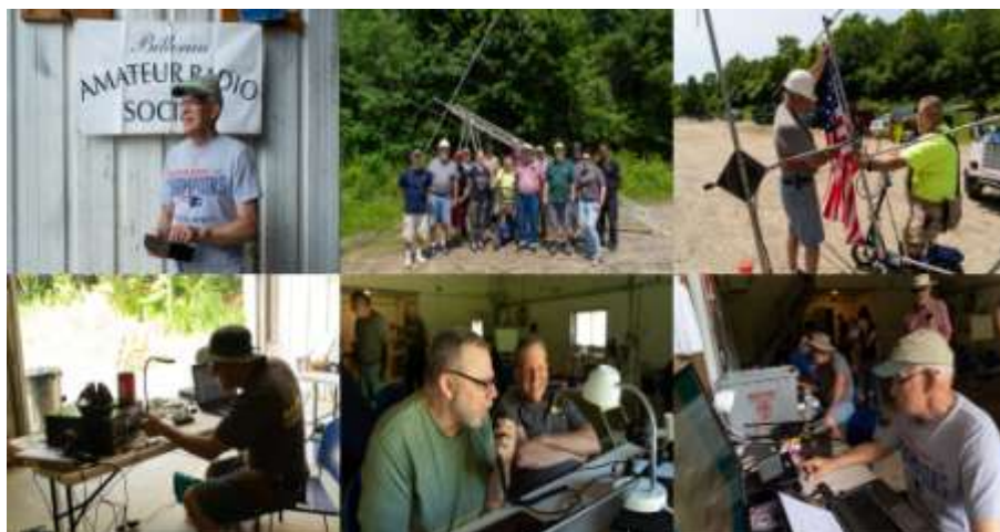
NEWS FOR AND BY BARS MEMBERS