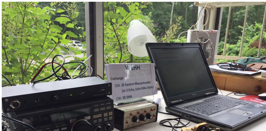
NEWS FOR AND BY BARS MEMBERS