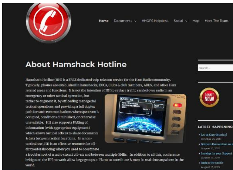
Figure 1 Hamshack Hotline Home Page

restrictions. A primary objective of the HH is to augment support of emergency communications for such scenarios where the internet is still accessible. As VoIP is full-duplex another practical use is ham-to-ham troubleshooting support over the phone. For hams that must have rf “in-the-loop” in order to even consider using a communications technology HH VoIP-to-RF links have been configured, essentially Radio over IP (RoIP), analogous to Echolink, IRLP and WIRES [4]. For additional information one may visit the Hamshack Hotline YouTube channel or examine other supporting information online [5, 6].