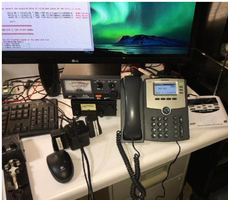
Figure 3. My Hamshack Hotline Provisioned Cisco SPA-504G IP Phone in My Shack.

exploring the HHUS network in the weeks and months to come and anticipate many other creative applications of this technology. If you happen to call my HH phone and I am not available, please leave your message after the tone!