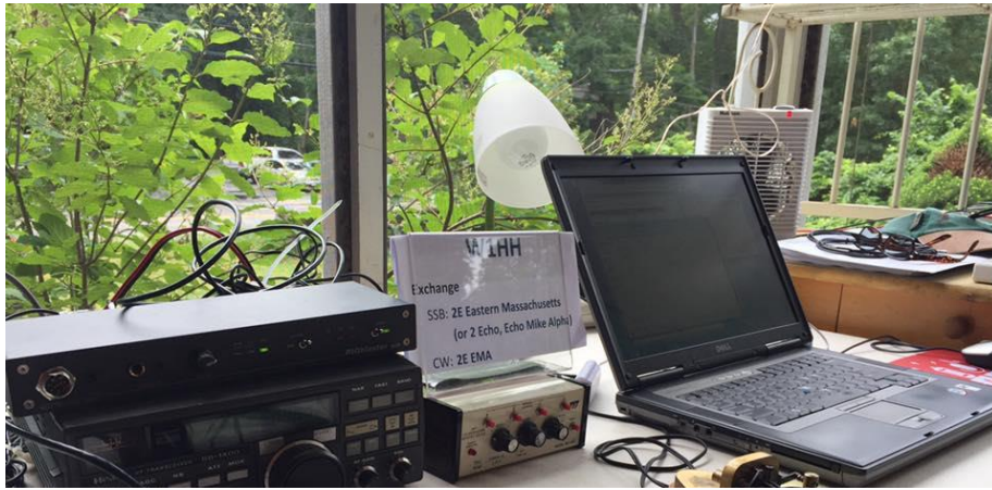
NEWS FOR AND BY BARS MEMBERS